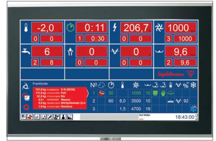
Auto-Command 4000 (optional)