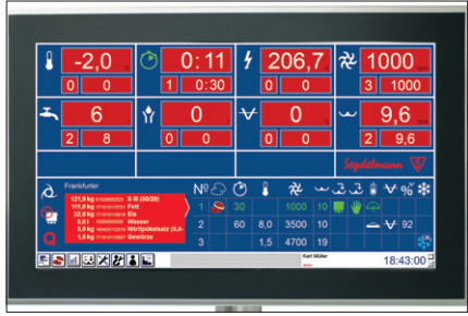
Auto-Command 4000 (optional)