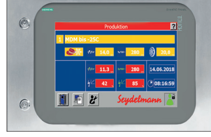
Command 700 W (optional with frequency controlled AC-6 main drive)