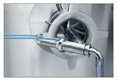
Pneumatic separating device (optional)