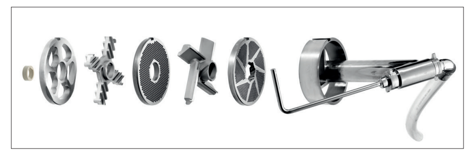
Separating set (optional)