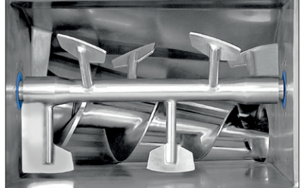
Top view: Hopper