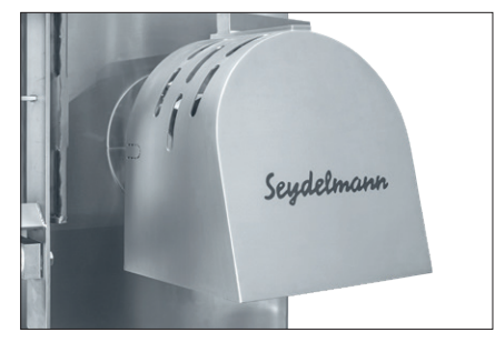
Outlet protection device